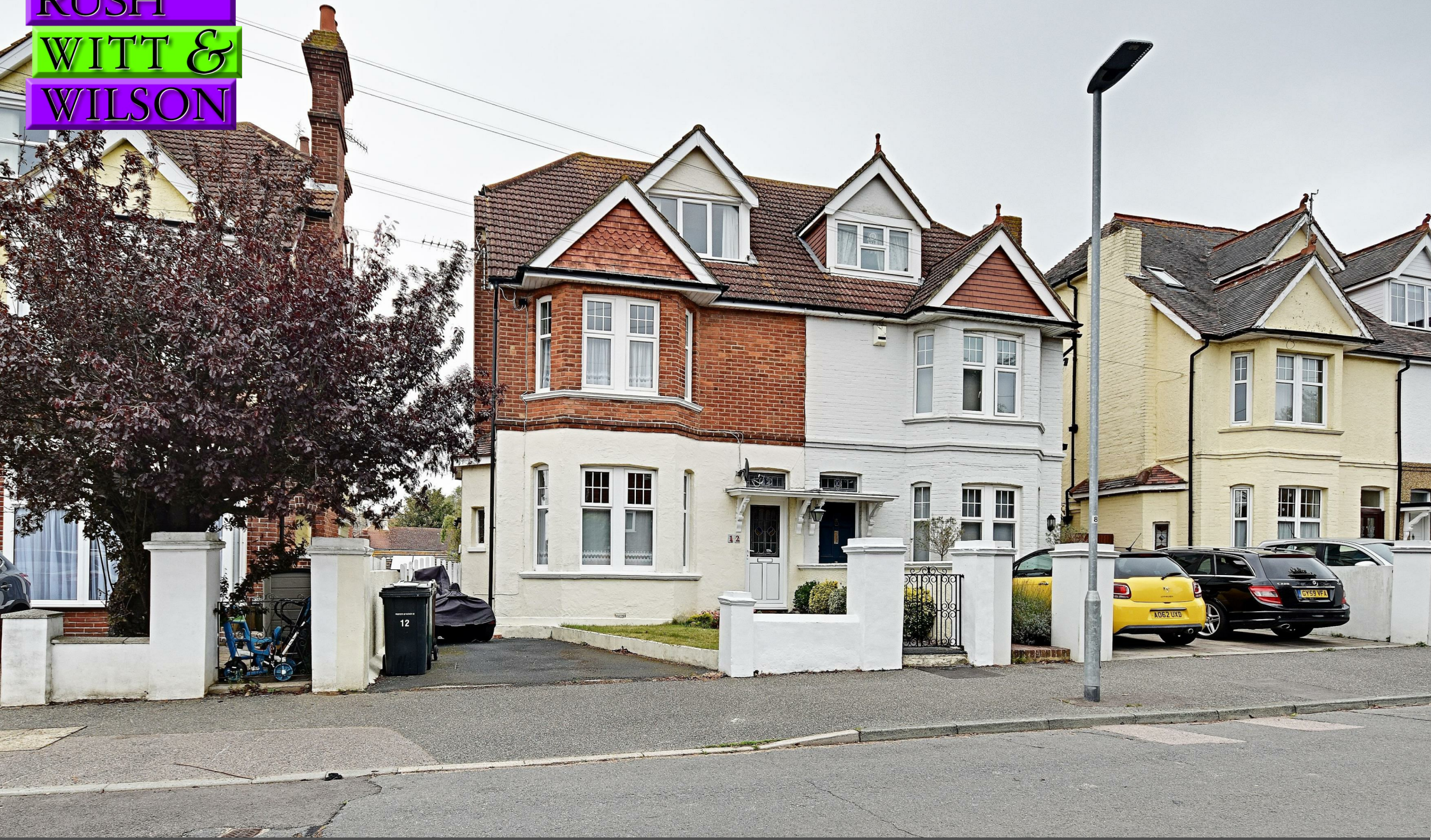
12 St. Georges Road, Bexhill-On-Sea, East Sussex TN40 2BG £425,000