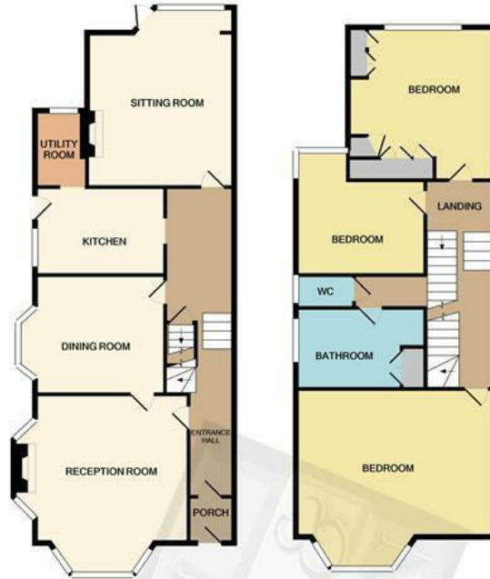
GROUND FLOOR APPROX. FLOOR AREA 773 SQ.FT. (71.8 SQ.M.)