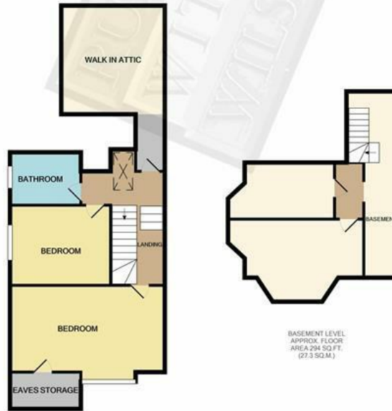
3RD FLOOR APPROX. FLOOR AREA 597 SQ.FT. (55.5 SQ.M.)